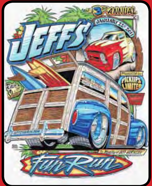
Thanks to Classic Performance Products, American Hot Rods, Original Parts Group Inc., and Hot Rods & Hobbies for providing additional card stops and shop tours for this year's event.